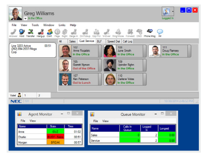
Contact center agent

When call volumes are high, UC Suite Client users can easily and quickly login as an agent to handle calls that are waiting in queue. The SV9100 Contact Center solution distributes call volume evenly among the agents that are logged in to the system, helping to reduce caller hold-time and resulting in improved customer satisfaction.