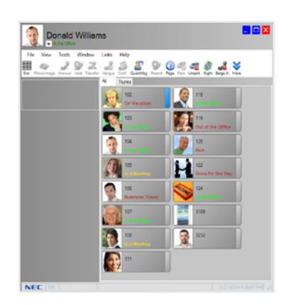
UC Suite Desktop Client